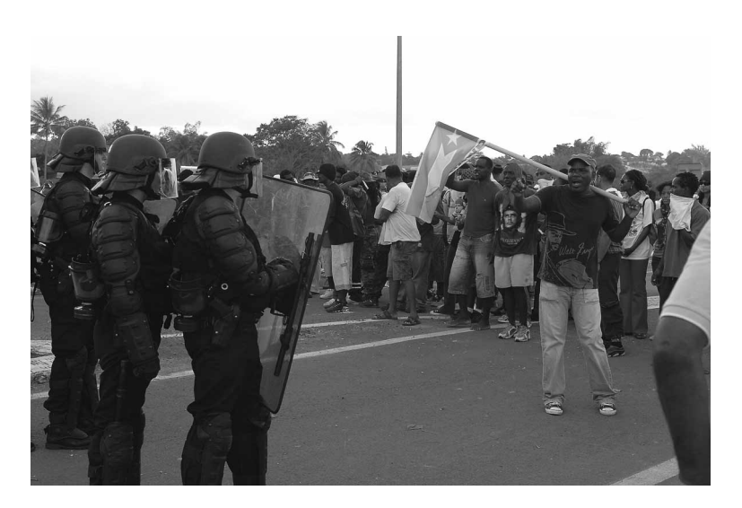
Figure 3 Protestors confront French Gendarmes at a barricade in Petit-Bourg

out true self-determination. They argue that they are not interested in administering the current political system, but in radically transforming it.